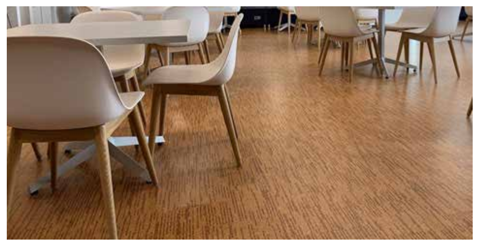
Mediterra 2.0 Pick up Strips Light

True hybrid finish • Chemical & abrasion resistance • Elasticity Finish yellowing resistance • Low sheen that enhances natural cork Ease of maintenance • Low VOC content & emissions Free from toxic solvents, formaldehyde, phthalates, heavy metals