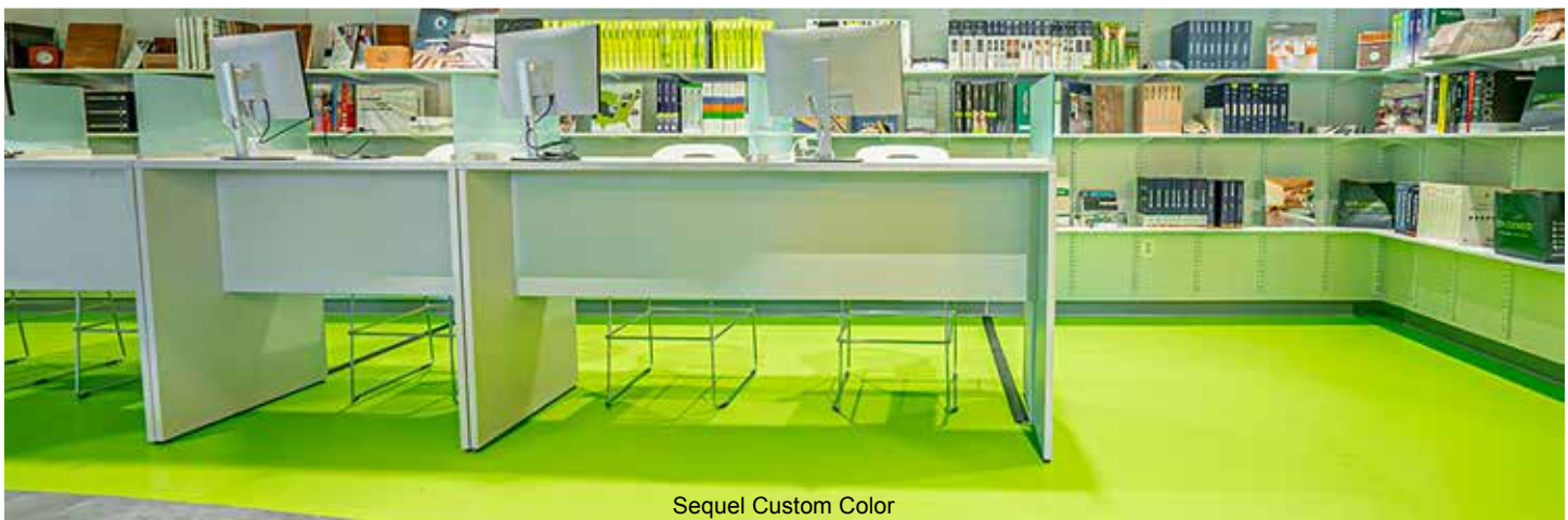
Sequel Custom Color

Sequel custom colors are available with a 4000 sf minimum. Provide Pantone numbers.