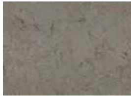
Billows Ore ECC3585