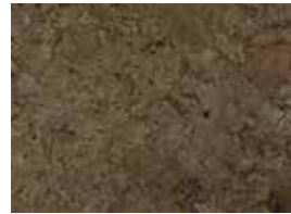
Billows Ash ECC3545