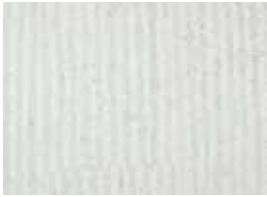
Channel White ECC3570