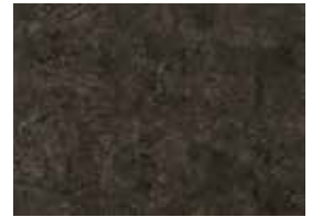
Billows Current ECC3590