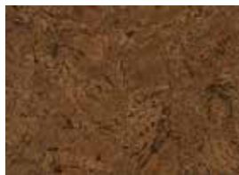
Billows Brown ECC3540