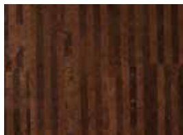
Broken Lines ECC3575