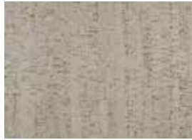
Gray Wash ECC3580