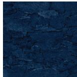
True Blue VAIC004